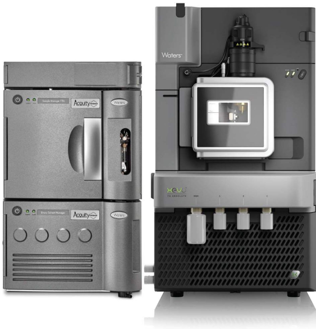
Figure 1. The Waters Xevo TQ Absolute Mass Spectrometer.